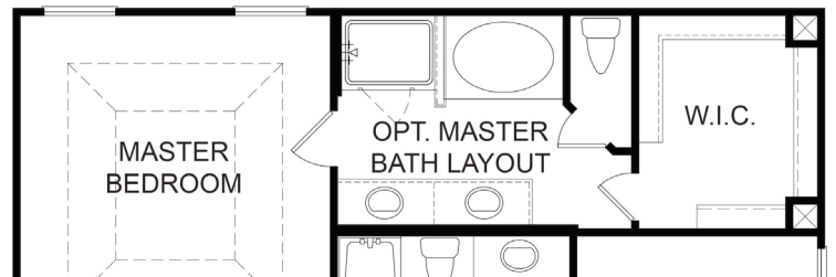
Opt. Master Bath Layout